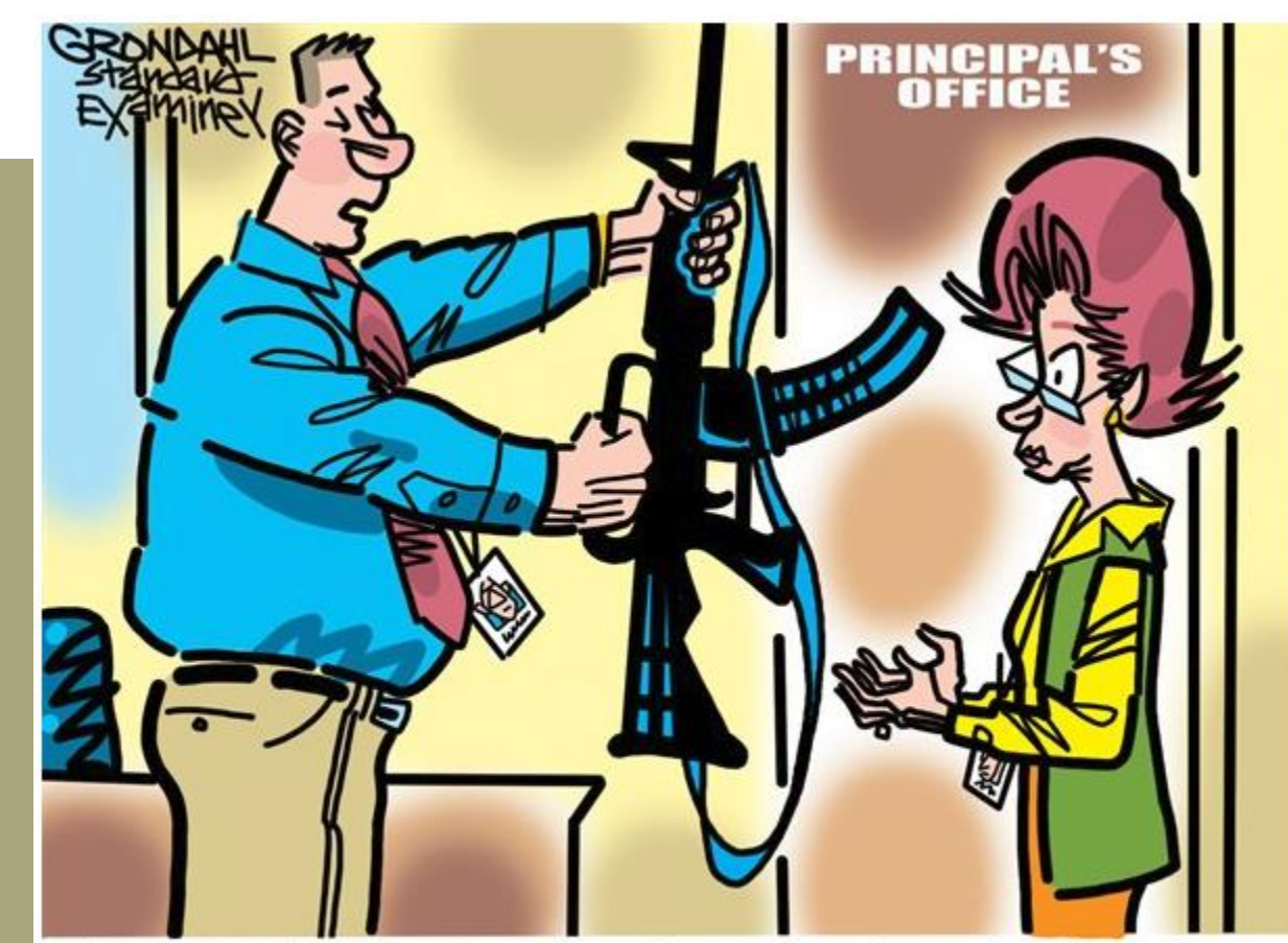
"An armed security guard isn't in the school budget, so all teachers will have to take turns."